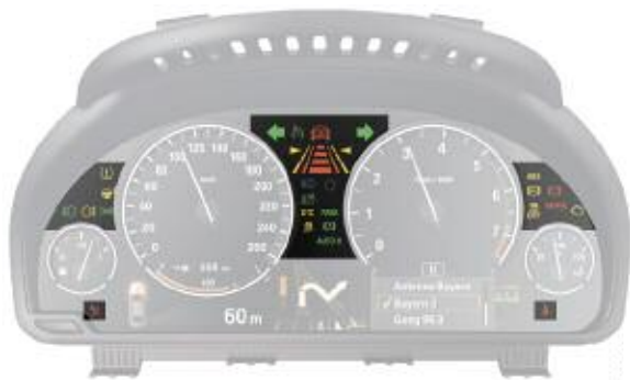
Indicator and warning lamps

The indicator and warning lamps can be illuminated in different colors or combinations.